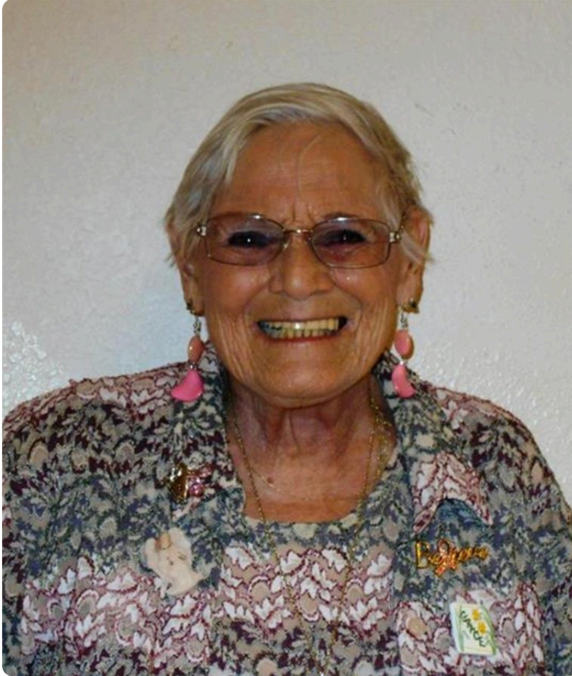
Our friend & sister-in-Christ in 2013